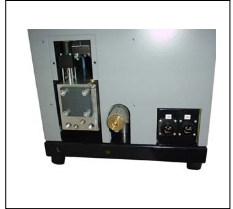
View to hose connection