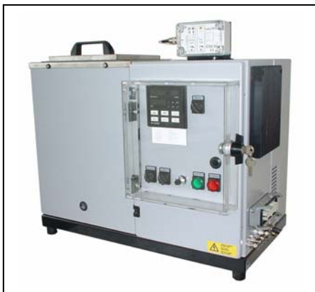
15 Litre polyamide applicator with level control and multi channel regulator