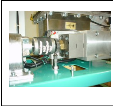
Pump drive with rotation measurement