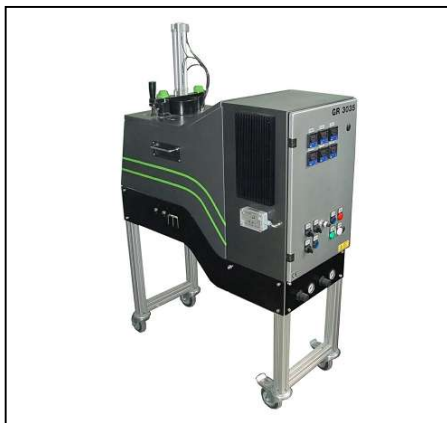
PUR-bag melting unit for 2kg- candles