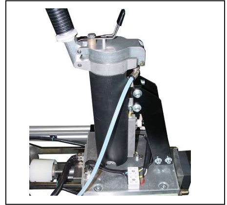
Melt tank with heating plate