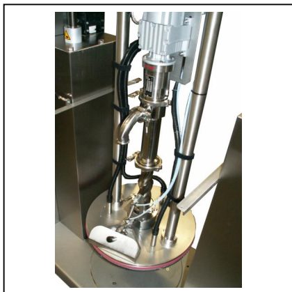
Progressing cavity pump