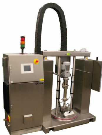
Drum unloader, in V2A version

Delivery and services are effected in accordance with the current terms of business of the SM Klebetechnik Vertriebs GmbH